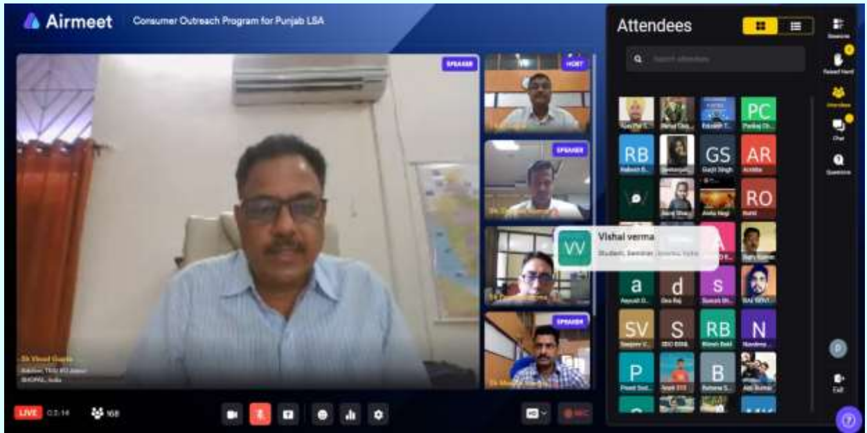
CoP for Punjab held on 06.11.2020