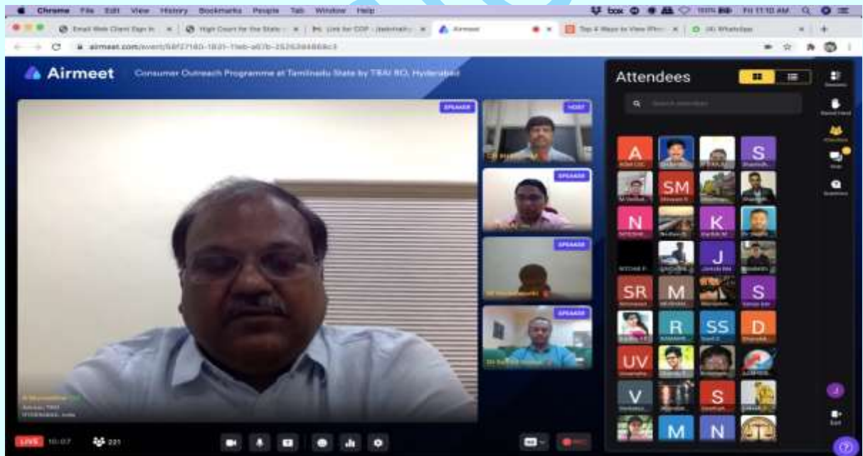
CoP for Tamilnadu held on 06.11.2020