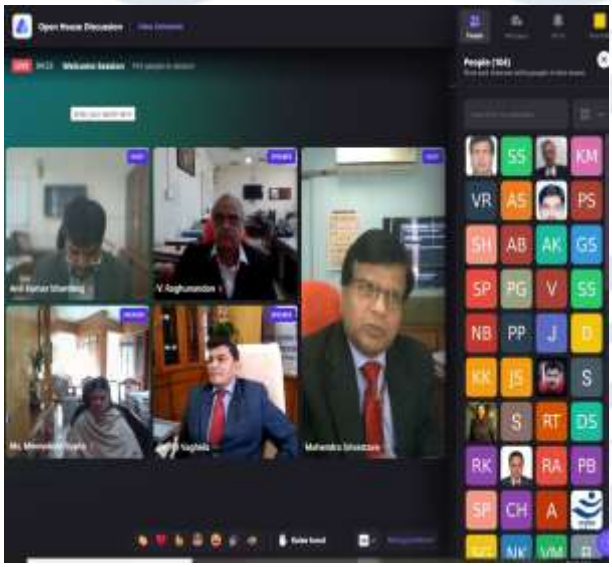
Open House Discussion (OHD) on 27th January 2022