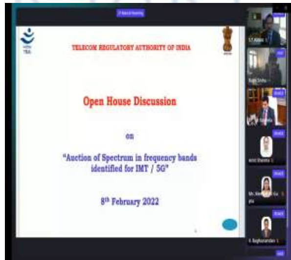
Open House Discussion (OHD) on 8 th February 2022

3.2 TRAI has held an Open House Discussion (OHD) on 25 th February 2022 through video conferencing on the consultation paper on “Licensing Framework for Establishing Satellite Earth station Gateway”.