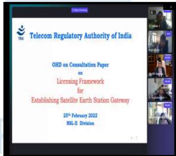
Open House Discussion (OHD) on 25 th February 2022