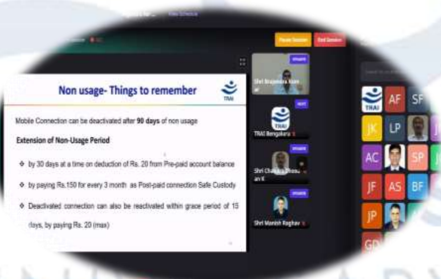
Consumer Outreach Program for Goa held on 22 nd February 2022 by Regional Office, Bangalore