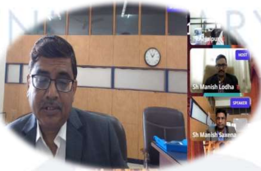
Consumer Outreach Program for Rajasthan held on 11 th February 2022 by Regional Office, Jaipur