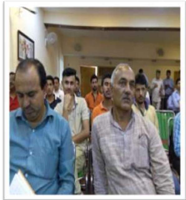
CoP at Nahan, Himachal Pradesh held on 18.05.2016