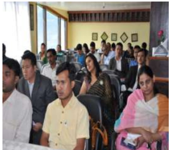
CoP at Gangtok, Sikkim held on 24.5.2016

Full details of the Directions/Orders, Recommendations, Consultation Paper, Subscription Data, etc as mentioned in this newsletter are available on our website