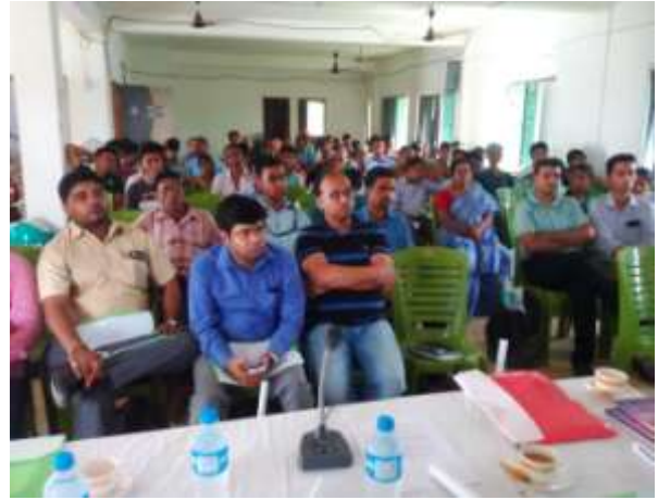
CoP at Canning, West Bengal held on 31.05.2016